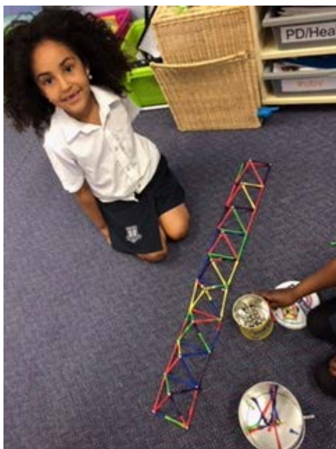
Patterns & Alphabet