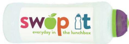
Frozen water bottle