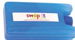
Frozen ice brick