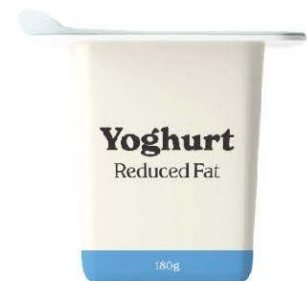
Frozen reduced fat yoghurt tub

For more great tips on keeping the lunchbox cool visit: