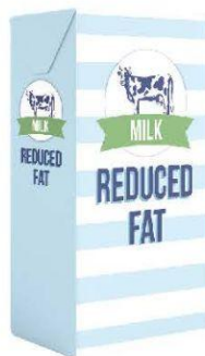
Frozen plain milk popper