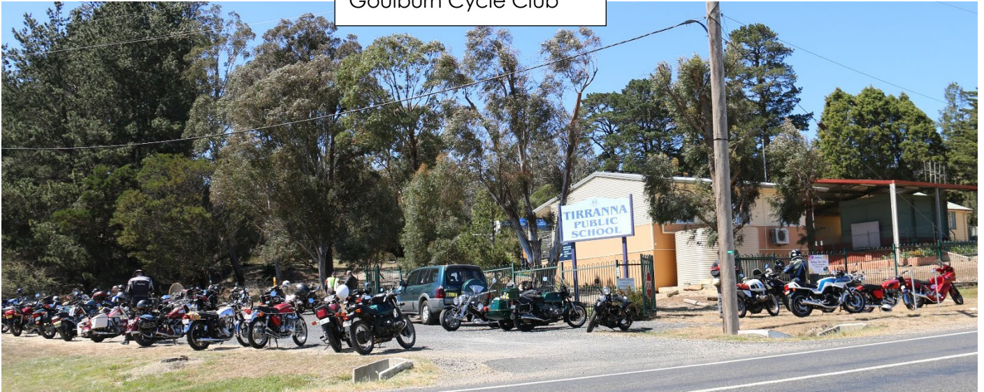
Goulburn Cycle Club