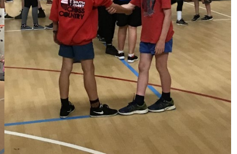
Berry Sport & Rec Camp 14 to 18 October 2019